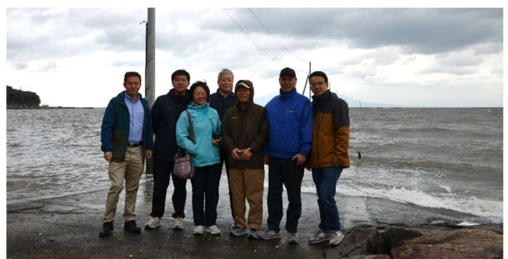
Field trip to Sumiyoshi Coast in Kumamoto Prefecture